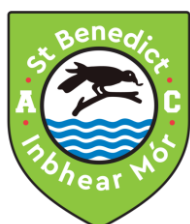
St Benedict Inbhear Mór